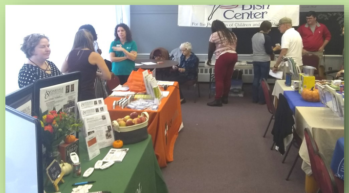
Information gathering at the Health Fair