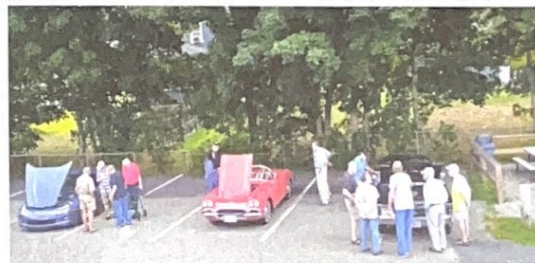
Classic car enthusiasts check out the gems at the Veteran's car show last month at the Senior Center.

SENIOR CENTER ART GALLERY open M-F 9am-2pm